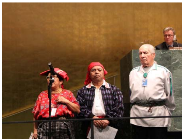
Indigenous elders at the Opening of the Eleventh Session of the UNPFII