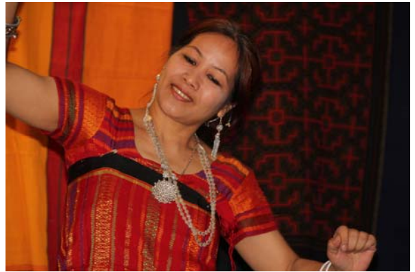
Chakma Dance, Cultural Event, UNPFII 2012

International Decade of the World’s Indigenous Peoples. The sponsors that contributed to the event were the Permanent Missions of New Zealand, Bolivia, Finland, and Norway, as well as the Maryknoll Office for Global Concern, the Royal Norwegian Consulate General, Passionists International, Sunray Meditation Society and the Salvation Army.