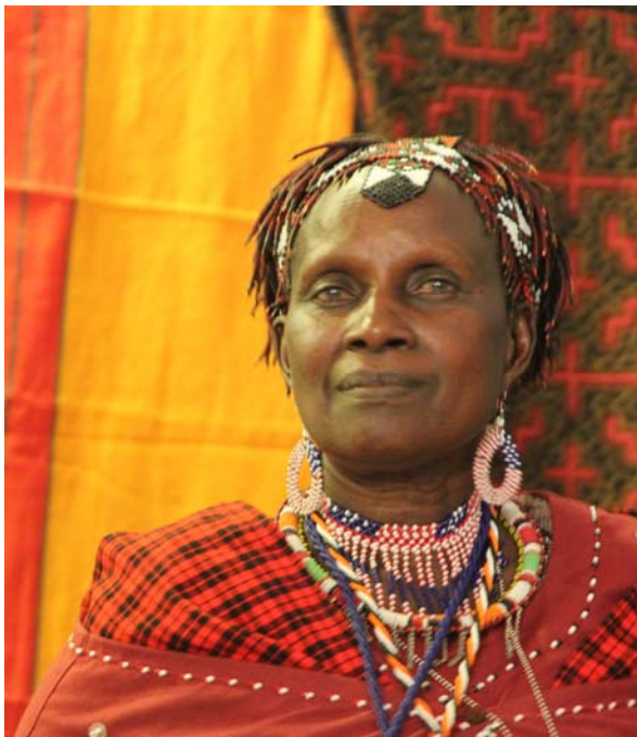
Participant at 11th Session of the UNPFII

The Forum also focused on Violence against Indigenous Women and Girls, building on the outcome of the January expert group meeting. There was lively debate and discussion among Member-states, UN agencies including UN Women, UNFPA, UNICEF, as well as IPOs emphasizing the different dimensions and the need to continue efforts towards its elimination.